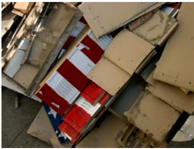
Peter Wegner From WALLS , 2007 Portfolio of 6 photographs on archival paper 12 x 15 inches each

The exhibition's centerpiece, THE UNITED STATES OF NOTHING , is a vast field of darkness punctuated here and there by real American placenames like "Nix," "Nada," and "Nameless." Rendered in white neon and installed on a single blue painted wall, the eighteen placenames and their exact geographical coordinates will be strewn across 400 square feet of the main gallery. Wegner's vision of America is both disconsolate and deadpan, its darkness leavened by the absurdity of names conjured out of nothing. As Wegner notes of this body of work, "The naming of a town is a strange thing indeed. It's born of myth, odd circumstance, dire necessity."